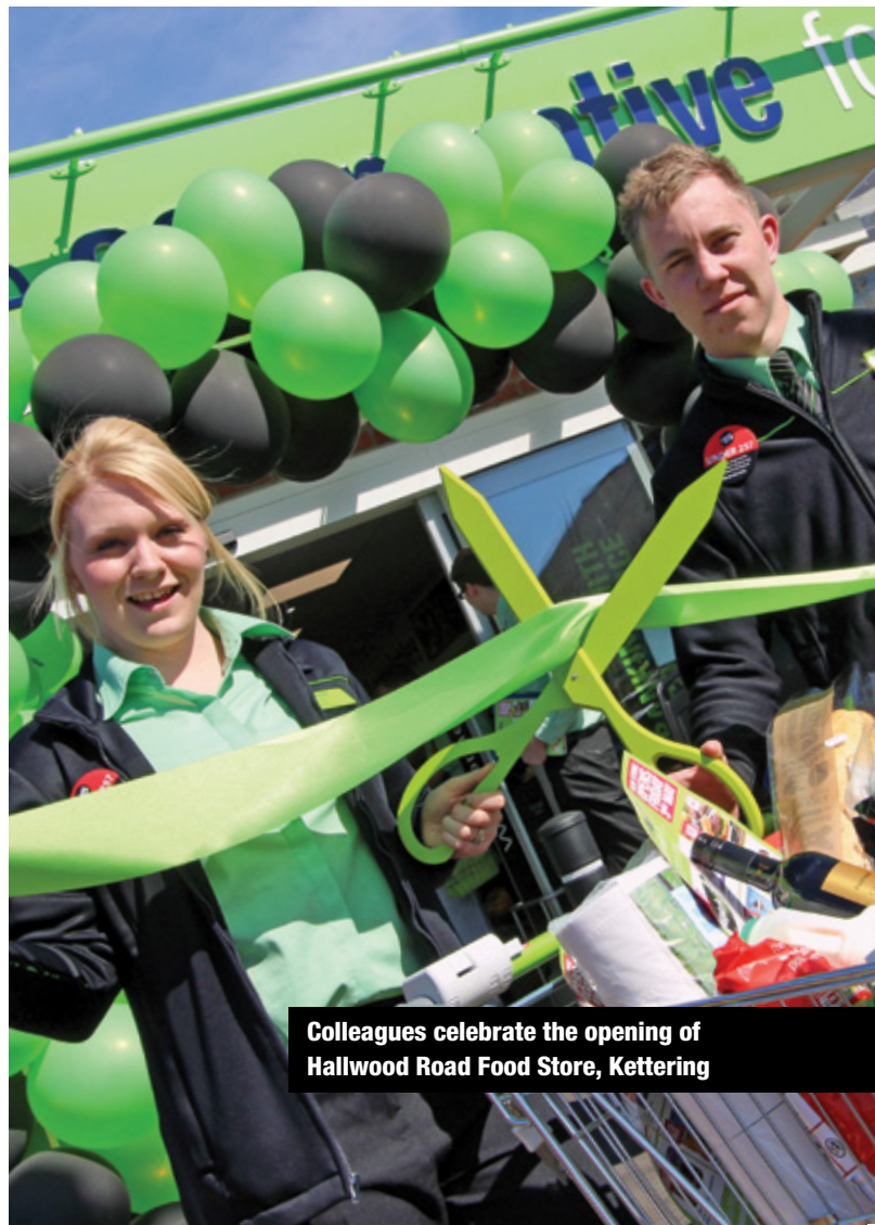
Colleagues celebrate the opening of Hallwood Road Food Store, Kettering

Investment in the Society’s Distribution Centres in Leicester has included the purchase of seven new vehicles, with three vehicles displaying special signage to promote the Society’s corporate charity, Newlife Foundation for Disabled Children. A major upgrade of the Society’s warehouse management system is underway, with the first phase of the implementation planned for early 2014. The new system will strengthen the service provided to food stores through the implementation of latest voice pick technology to further improve product availability and delivery accuracy.