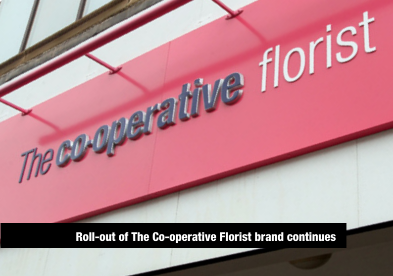
Roll-out of The Co-operative Florist brand continues