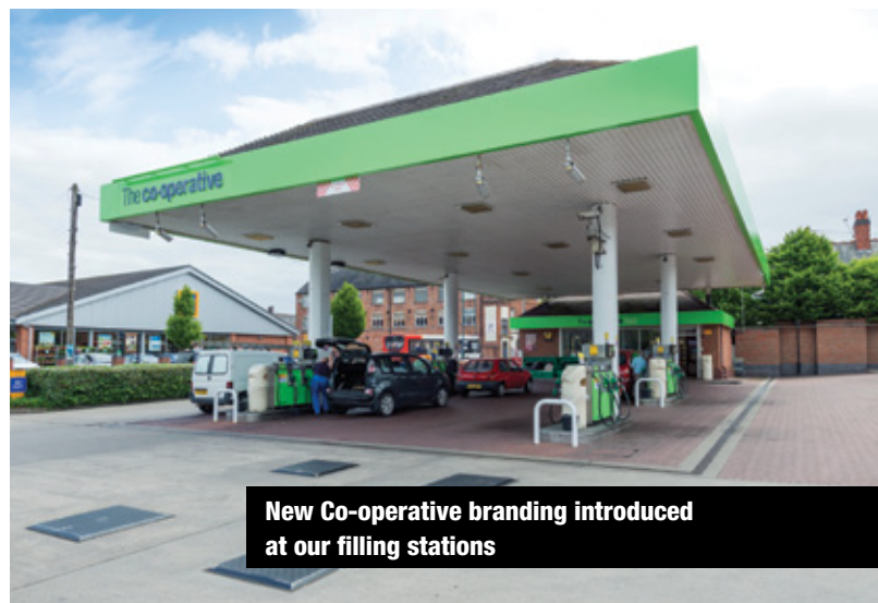
New Co-operative branding introduced at our filling stations