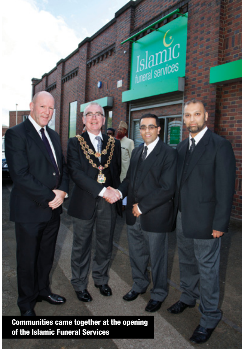
Communities came together at the opening of the Islamic Funeral Services

“Significant investment during the first half included opening five new food stores and two new funeral homes”