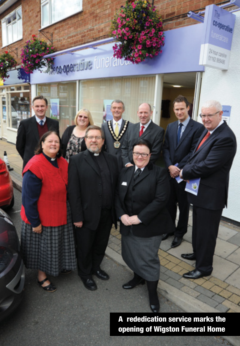
A rededication service marks the opening of Wigston Funeral Home