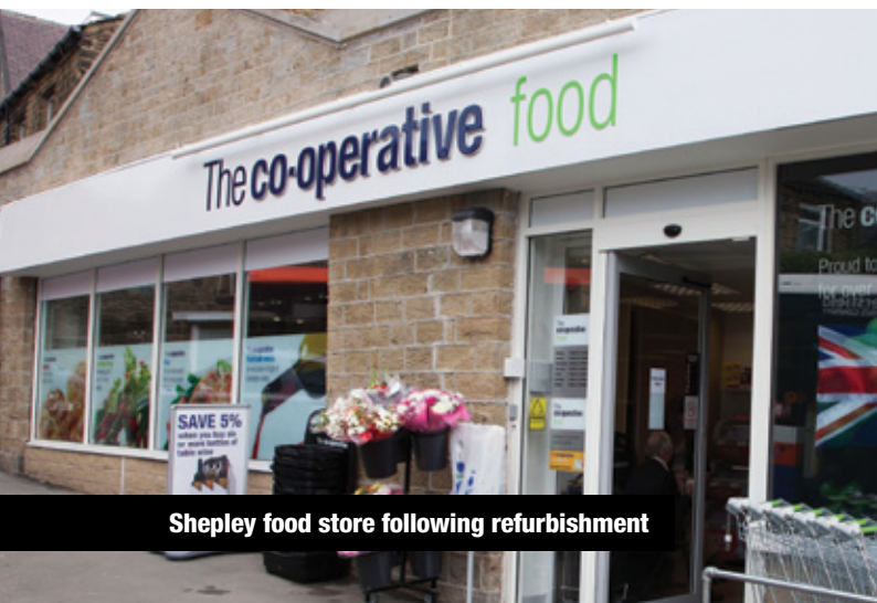
Shepley food store following refurbishment