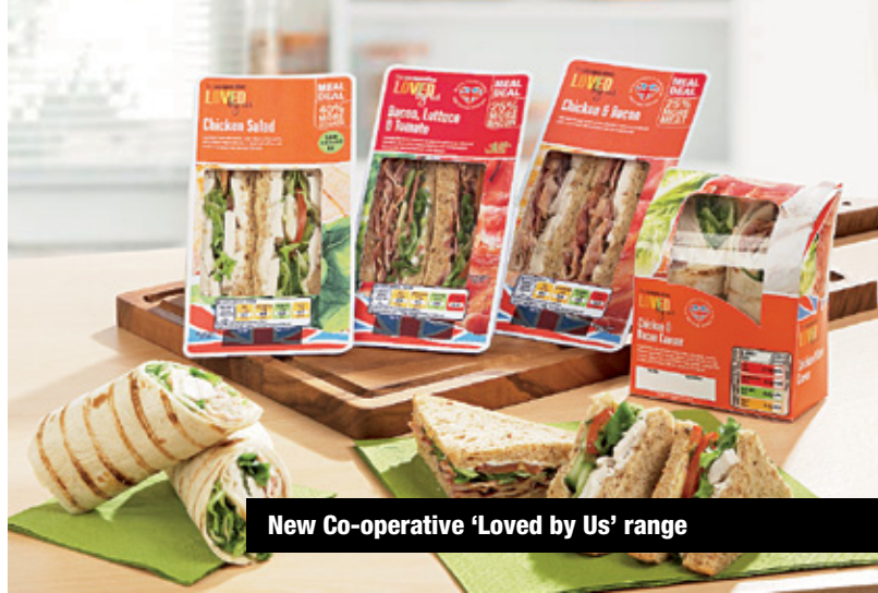
New Co-operative 'Loved by Us' range